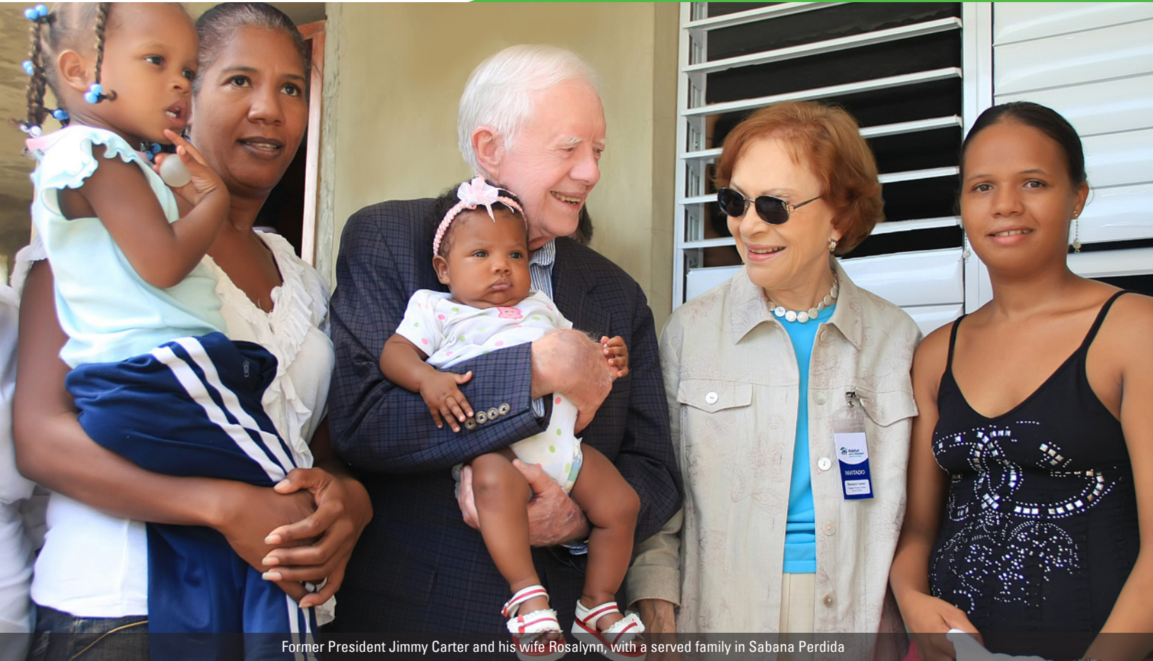
Former President Jimmy Carter and his wife Rosalynn, with a served family in Sabana Perdida