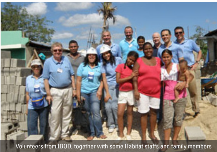
Volunteers from IBOD, together with some Habitat staffs and family members

We hosted more than 100 volunteers who participated in construction and non construction activities. These included: