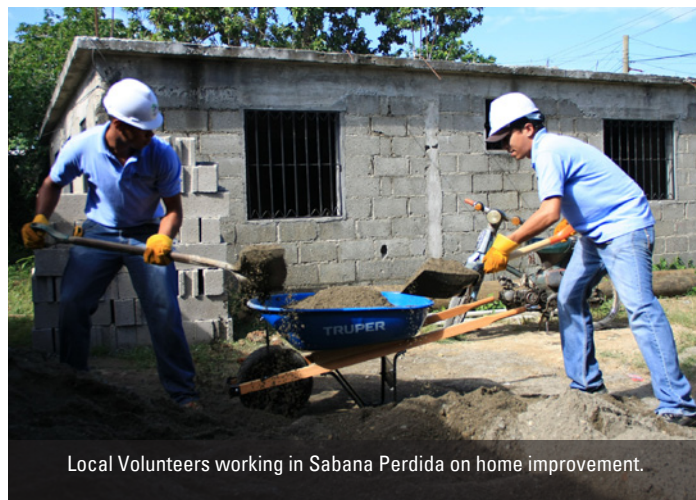
Local Volunteers working in Sabana Perdida on home improvement.

More generally, this semester saw 301 housing solutions, nine of which were new homes in San Juan, and 292 house repairs in various communities such as Haina, El Seibo, Santiago, Los Alcarrizos and Sabana Perdida.