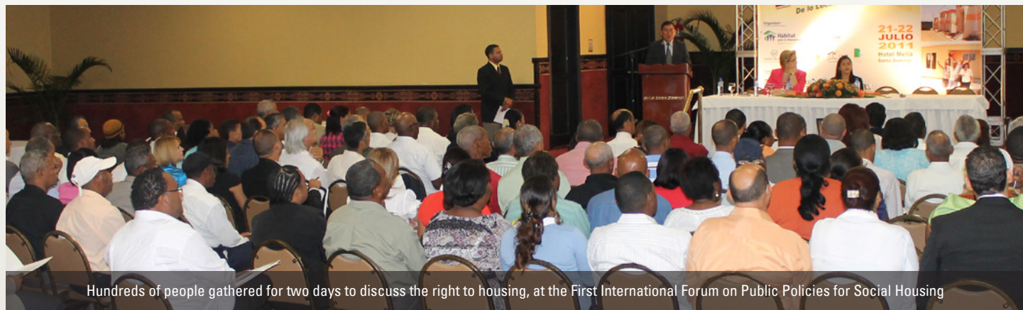
Hundreds of people gathered for two days to discuss the right to housing, at the First International Forum on Public Policies for Social Housing

Pertaining to activities of community development, we helped strengthen the capacities of many families with informative workshops on Financial Education, Technical Assistance on Construction, and Management of Waste Water. Around 20 community leaders, representatives of the Network of Leaders, and Parents and Friends of World Vision benefitted from these workshops. Also 299 families of San Francisco de Macorís, Nagua, Haina, El Seibo, Los Alcarrizos and San Juan de la Maguana learned more about housing - technically and financially.