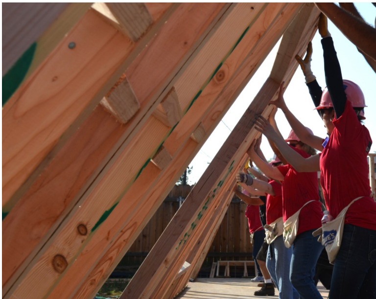
Wells Fargo women raise the walls