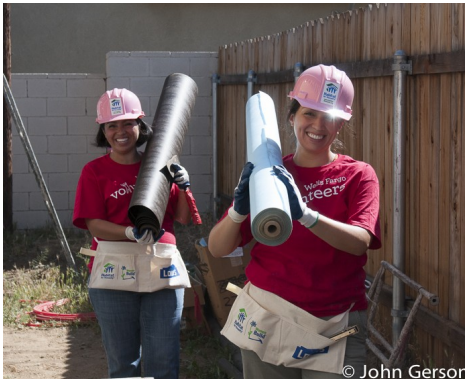
"Work hard, play hard" was the motto for our women volunteers during the April 20 volunteer day!